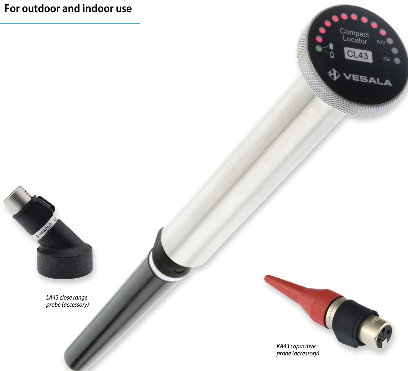
LA43 close range probe (accessory)